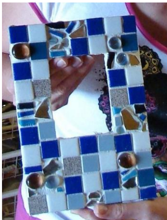
We made beautiful photo frames in our recent mosaic class

“Now the serpent was more crafty than any of the wild animals the Lord God had made”