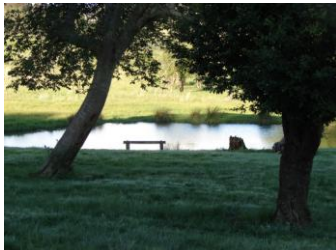
A quiet place to recuperate

Please visit our website at www.4flies.co.za for specials